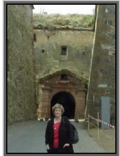
Exploring Festung in Koblenz.