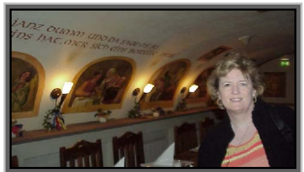
Attending the Spargel (white asparagus) festival in the village of Schwetzingen, Germany.