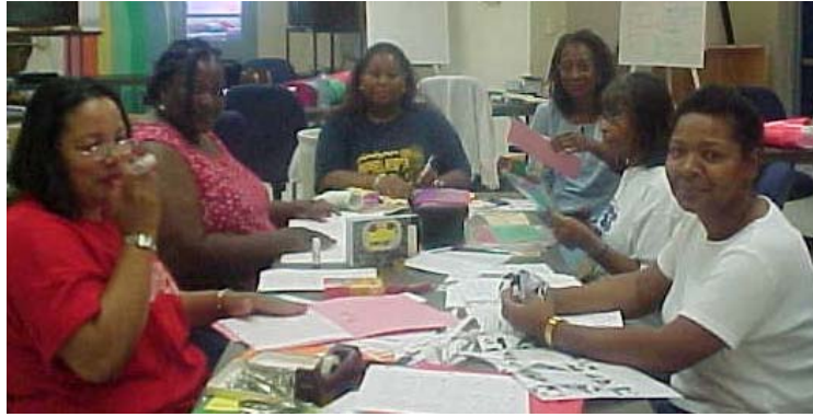
Teachers from Richland One in Columbia, SC, are hard at work at a recent Make and Take Workshop.