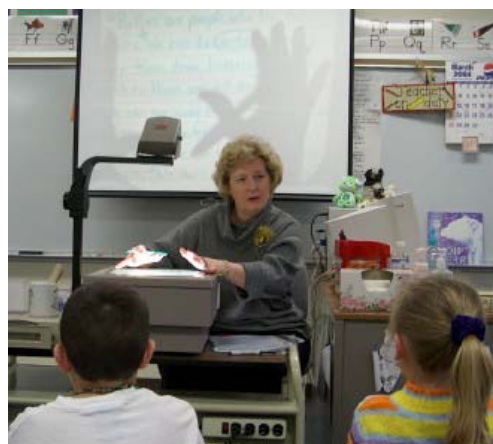
Here I am modeling a writing mini-lesson with the kids at Mentone Elementary in Mentone, IN.