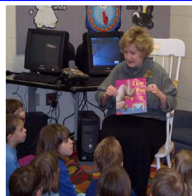
Reading with kindergarteners at Mentone Elementary.